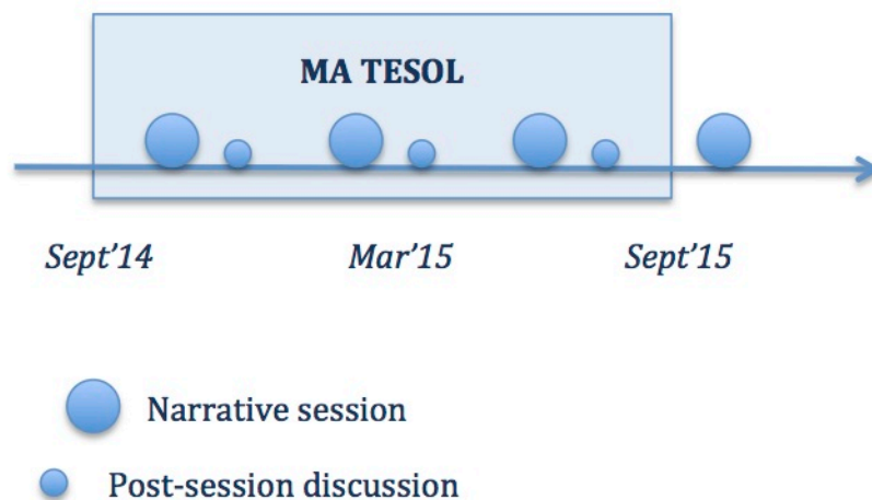
Figure 1 A graphic summary of the data generation process

As it is evident from the figure, the data generation process lasted for approximately one year. It started in October 2014, shortly after the programme began, and finished in late 2015, a few months after the programme was complete. The data generation process included seven encounters with the participants: four narrative sessions (indicated with big circles) and three post-session discussions (indicated with small ones). Each narrative session, except for the last one, was paired with the post-session discussion that followed it. They complemented each other, and together they formed a round of data generation. Altogether, there were four rounds of data generation with the fourth round containing only narrative sessions. The first round took place in the first semester, the second one in the second semester, the third one during the dissertation stage, and the forth one right after the programme was complete.