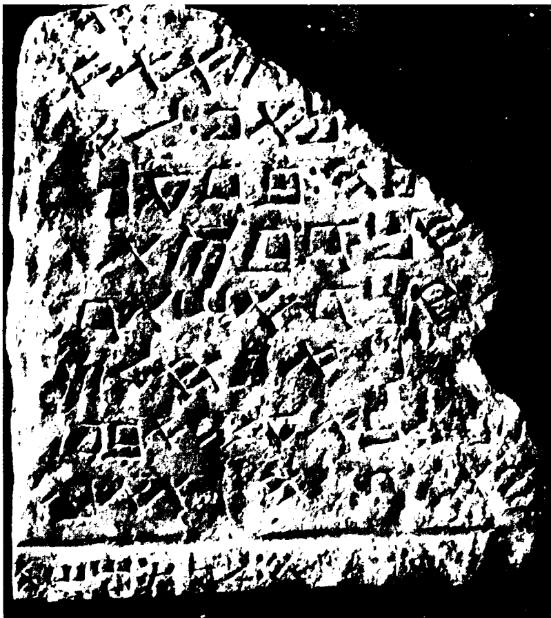
THE LEEDS SAMARITAN DECALOGUE INSCRIPTION