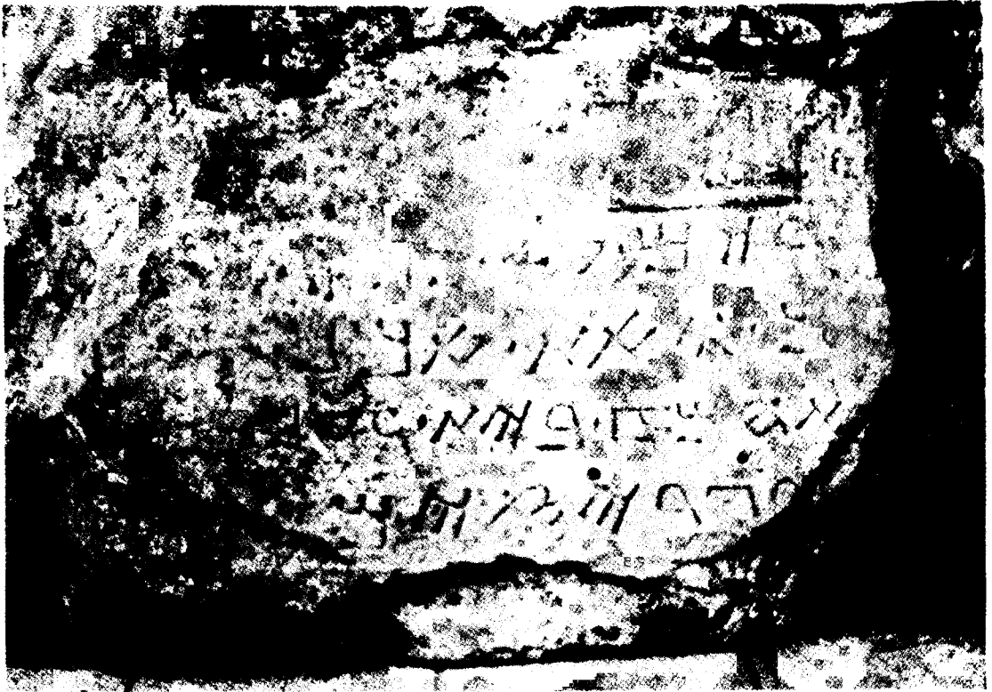
THE PALESTINE MUSEUM SAMARITAN DECALOGUE INSCRIPTION (left hand fragment)