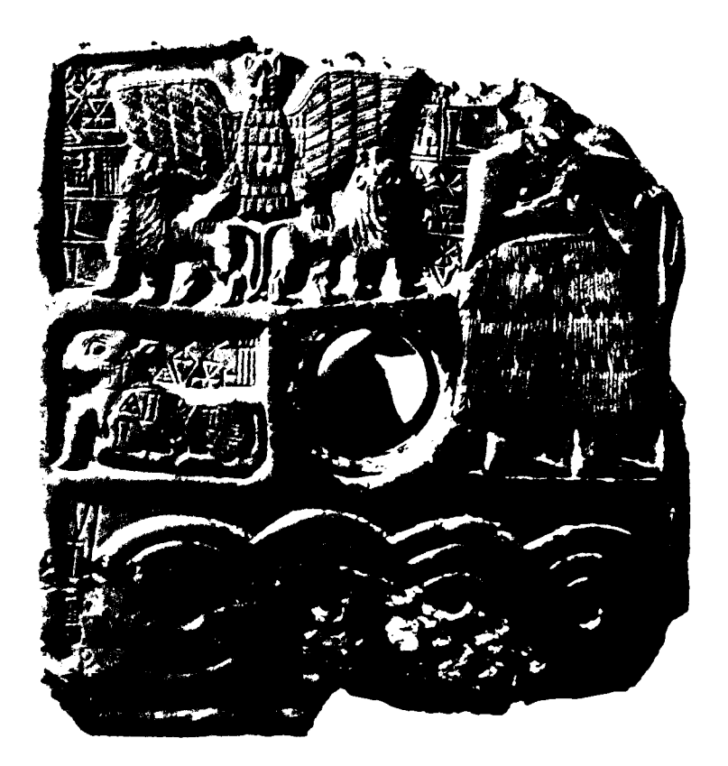
1. TOP LEFT: THE DIVINE IM-DUGUD BIRD. BAS-RELIEF, MIDDLE 3rd MILLENNIUM, FROM LAGASH.