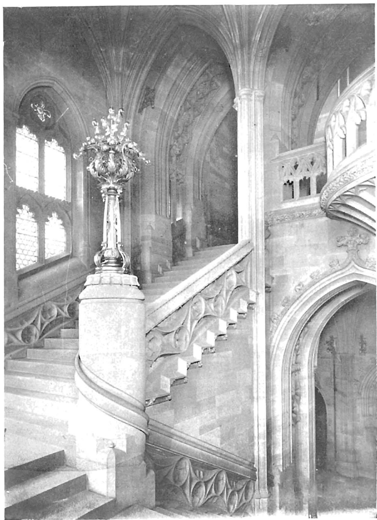
THE MAIN STAIRCASE