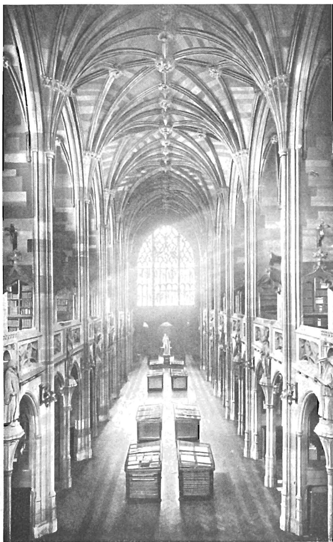
THE MAIN LIBRARY.