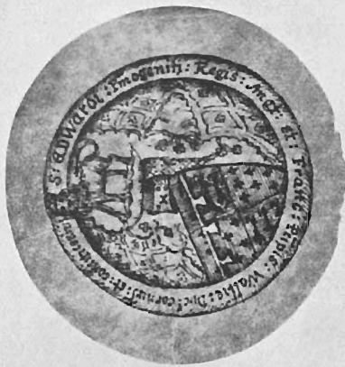
PLATE I.—THE JODRELL PASS.