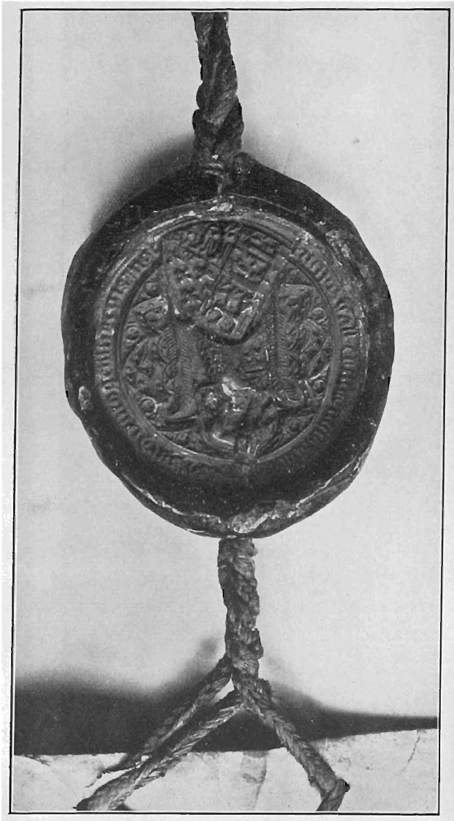
PLATE II.—SEAL B.